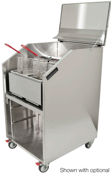
Shown with optional Fryer