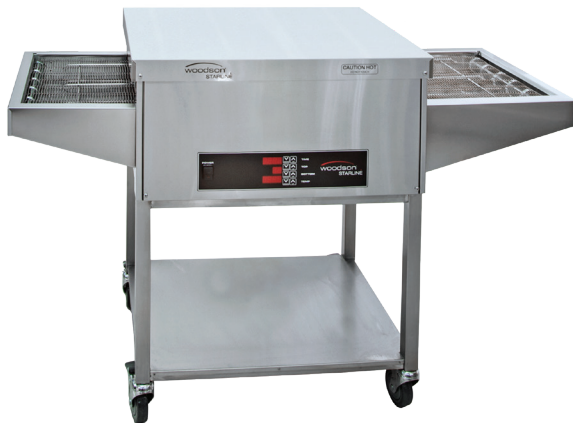
*Optional trolley, and left to right model shown